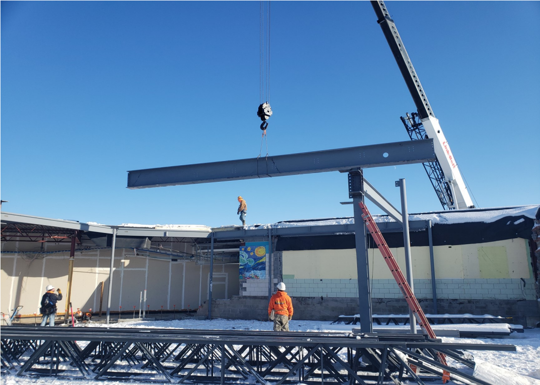
Installed Ceiling and Paint in Science Room