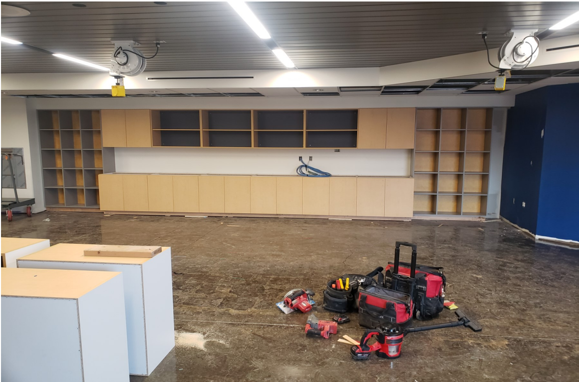
Exterior Framing of the New FACS Rooms