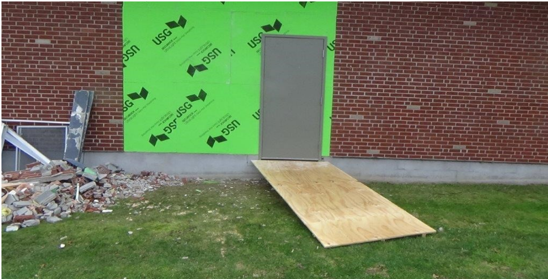
Driveway Installed at Florence Brassier