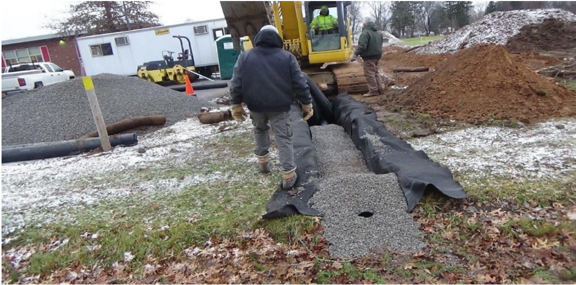
Temporary Door Installed at Florence Brassier