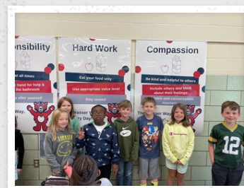
Compassion is one of our Brasser Way Focus Traits