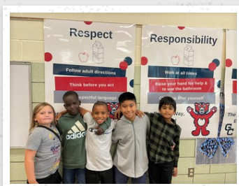
Brasser Bears Showing Respect and Responsibility in the Cafe