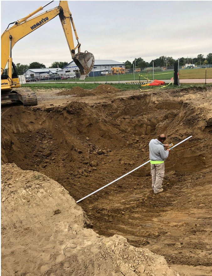
Digging for Stormwater Systems