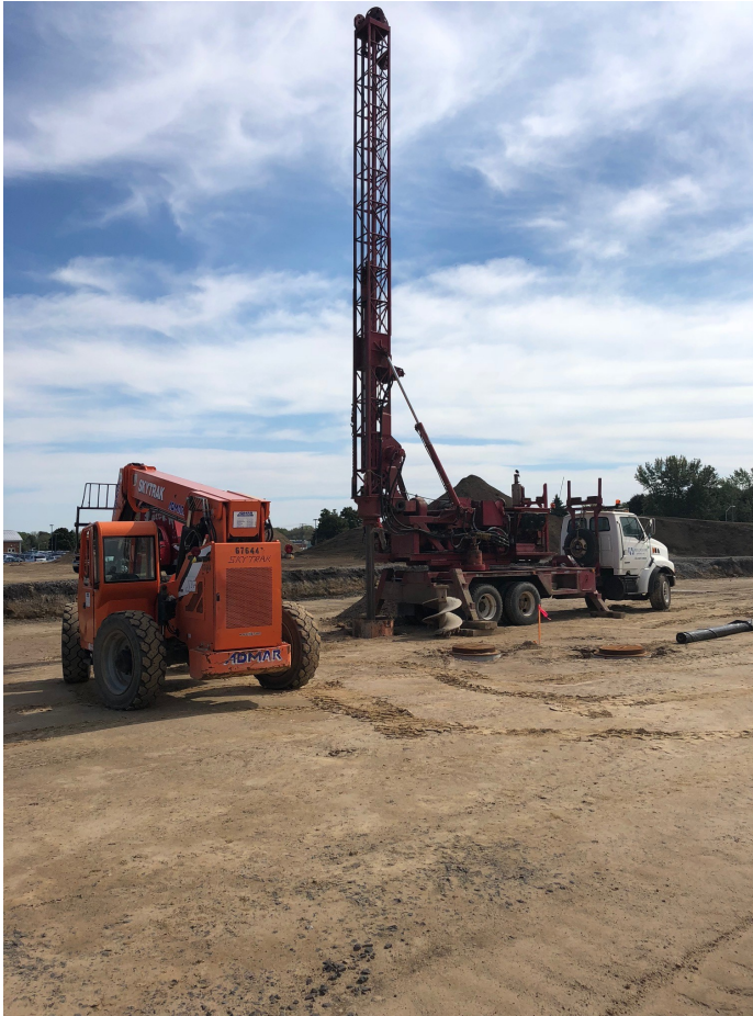
Drilling for Musco Lights