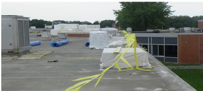
Roofing scheduled for completion by end of October