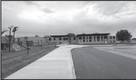
Neil Armstrong Elementary School

The entire project is currently on budget and, barring any additional unforeseen material and labor shortages, it is expected to be completed by spring 2022.