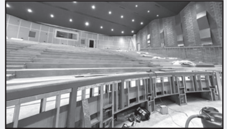
Performing Arts Center