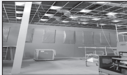
Instrumental Music Room