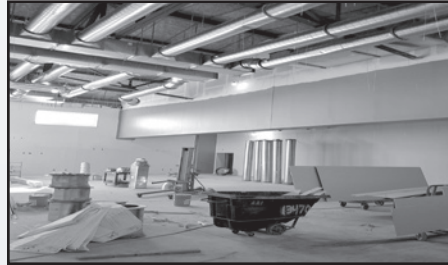
Vocal Music Room