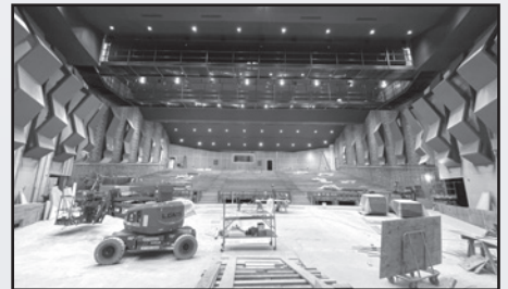
Performing Arts Center