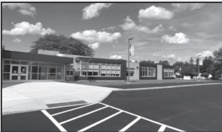
Walt Disney Elementary School