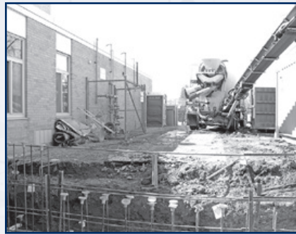
Paul Road Elementary School