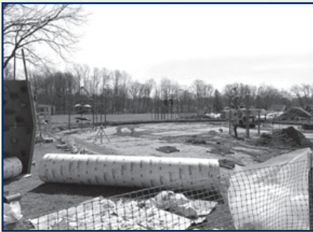
Florence Brasser Elementary School

The entire project is scheduled to be completed in fall 2021. The latest developments can always be found on the Gates Chili website at www.gateschili.org/capitalproject .