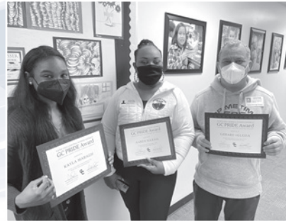
Feb. 15 recipients

Gates Chili CSD is proud to recognize students, staff and community members who go above and beyond on behalf of the district and its students. The GC PRIDE Award stands for and honors professionalism, respect, innovation, dedication and excellence. Congratulations to all of the recipients for February and March.