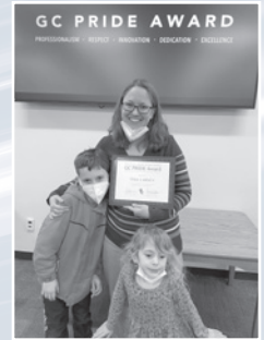
March 22 recipient