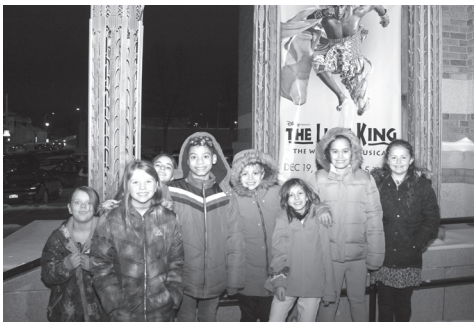
Walt Disney fourth-graders were ready to take in the sights and sounds of "The Lion King."

The ARTS Partners program at Gates Chili is now in its third year. Last year, the program was awarded the 2019 Magna Award for equity in education by the National School Boards Association (NSBA).