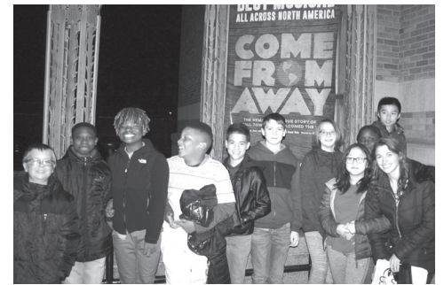
Gates Chili Middle School students attended the Nov. 21 performance of "Come From Away."